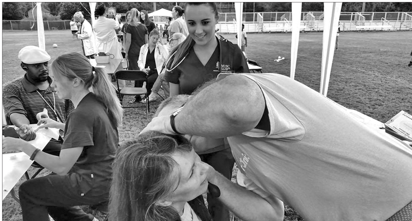
Physician assistants and MUSC PA students held free health screenings at North Charleston High School stadium last October for the Tri-county citizens who needed them.