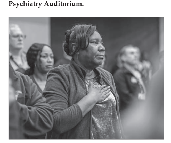
The Nov. 8 program began with the Joint Base Charleston Color Guard's presentation of colors and Pledge of Alligance.

this pivotal war continues to decrease, which also contributes to the changing face of the military.