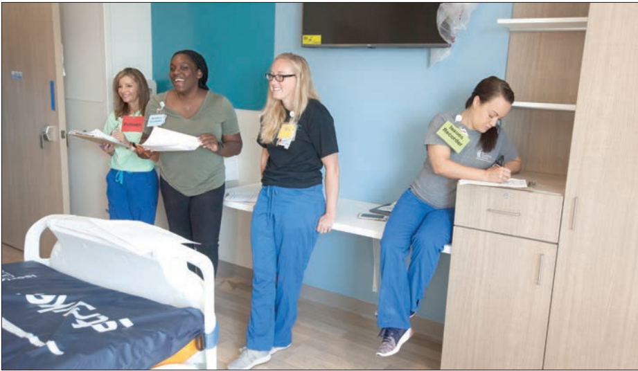
Team members flipped light switches and tried as many things as they could think of to catch issues and refine processes in the new hospital.