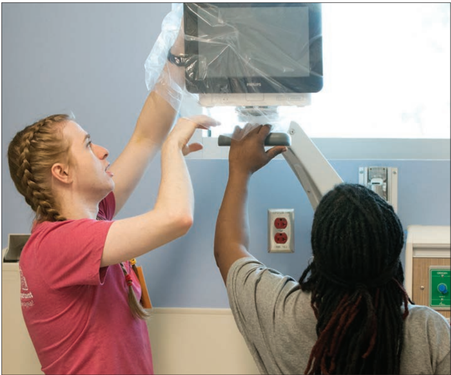
Care team members discuss scenarios during the first “Day in the Life” run-through at MUSC Shawn Jenkins Children’s Hospital and Pearl Tourville Women’s Pavilion.

members needed to figure out where supplies were stored, call respiratory therapy, draw blood and figure out where to send it, take the patient to the hydrotherapy room and then call child life. And after all that, the patient locked himself in the bathroom. Another team’s scenario involved assessing a bariatric patient’s room. At first, it seemed like the extendable arm that holds a computer was blocking the bathroom door from opening all the way; then they realized the arm was simply stiff because it was new. However, they did think the placement of the toilet paper roll would be in the way for bariatric patients. In the women’s pavilion, team members pressed the nurse call button and then had to track down where it was sounding. In the Emergency Department, members noted that detachable monitors that travel with patients to their floors are great, but there must be a mechanism by which to get the monitors back to the ED. “Everyone seems to be having a lot of fun. They’ve uncovered some issues that we need to solve, but there’s a lot of engagement, and people really seem to enjoy their new homes,” Scheurer said. The superusers will return for another Day in the Life in August and a final one in September. Each new session will add more elements. The technology will be in place and there will be more beds