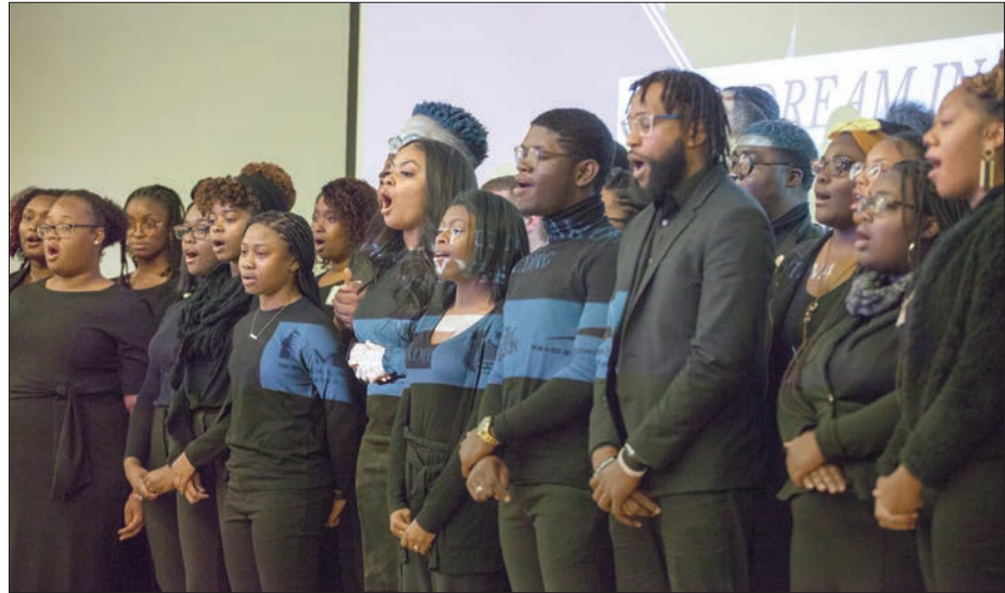
The Black History Intercollegiate Consortium district choir performs.