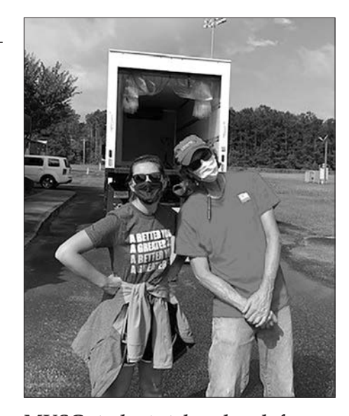
MUSC students take a break from unloading trucks and cases of food.

A heartfelt thank you goes out to the dedicated CARES volunteers who made this happen. They are changing what's