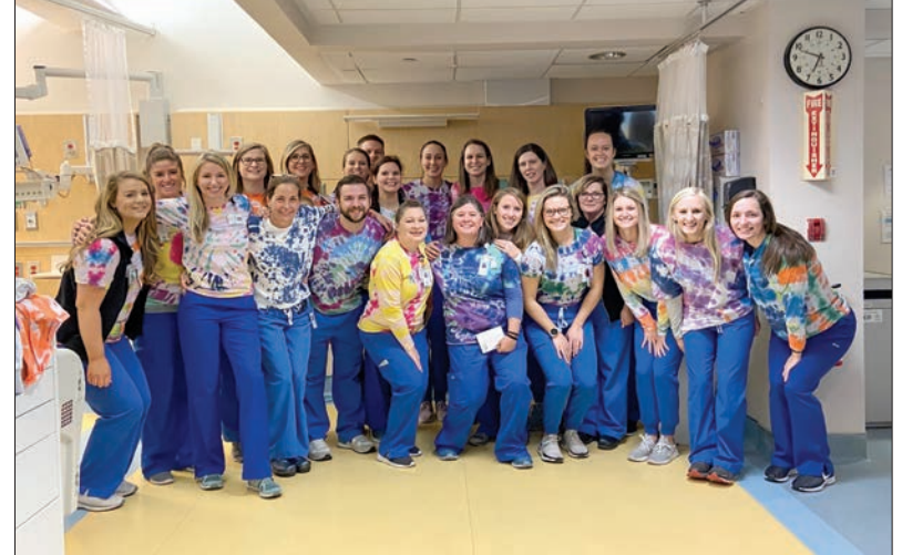
Top left: Acute care nurses ready an isolette for an incoming occupant. Middle left: The last team arrives at the MUSC Shawn Jenkins Children's Hospital and Pearl Tourville Women's Pavilion. Bottom left: Staff and volunteers stay on top of the move in their area. Bottom middle: PCICU team members celebrate Opening Day, excited to be in