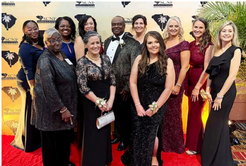
MUSC Health-Pee Dee Divisions' Palmetto Gold Award winners celebrated at the 2025 Palmetto Gold Gala in April.