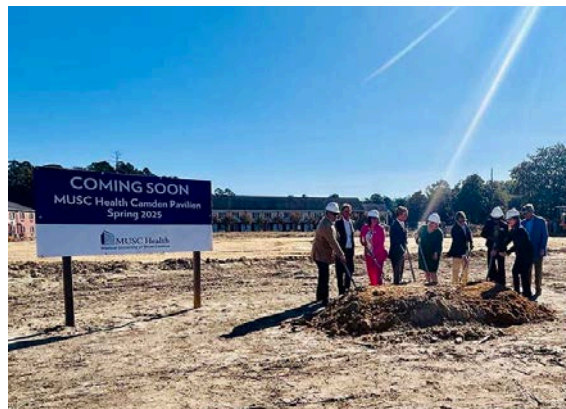
MUSC Health Midlands leaders, government officials from Kershaw County and developers of the women's center hold a ceremonial groundbreaking.