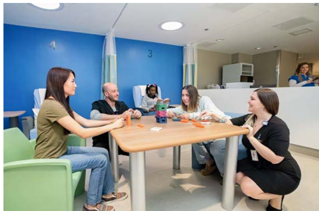
A look at the group therapy area in an EmPATH unit. The unit is designed to quickly get people facing behavioral health crises personalized care away from the bustle of ED.