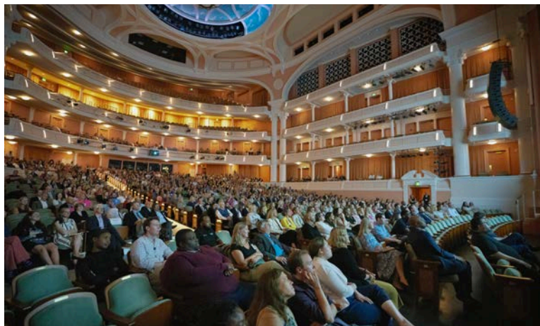
Engaged leaders at the Leadership Forum in April.