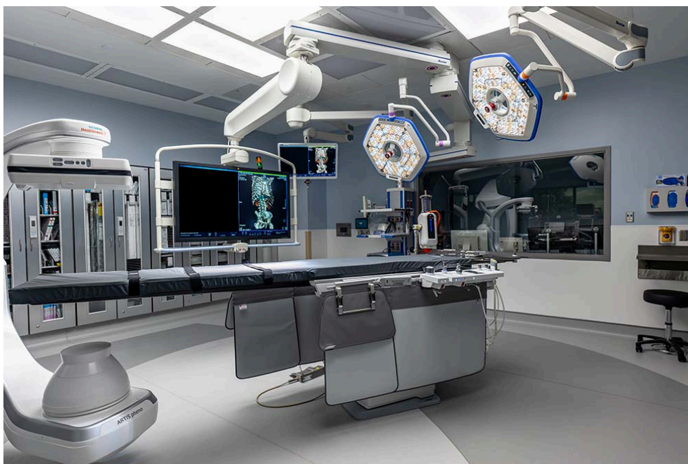
The new hybrid operating room will allow patients who need multiple procedures to get them in one place.