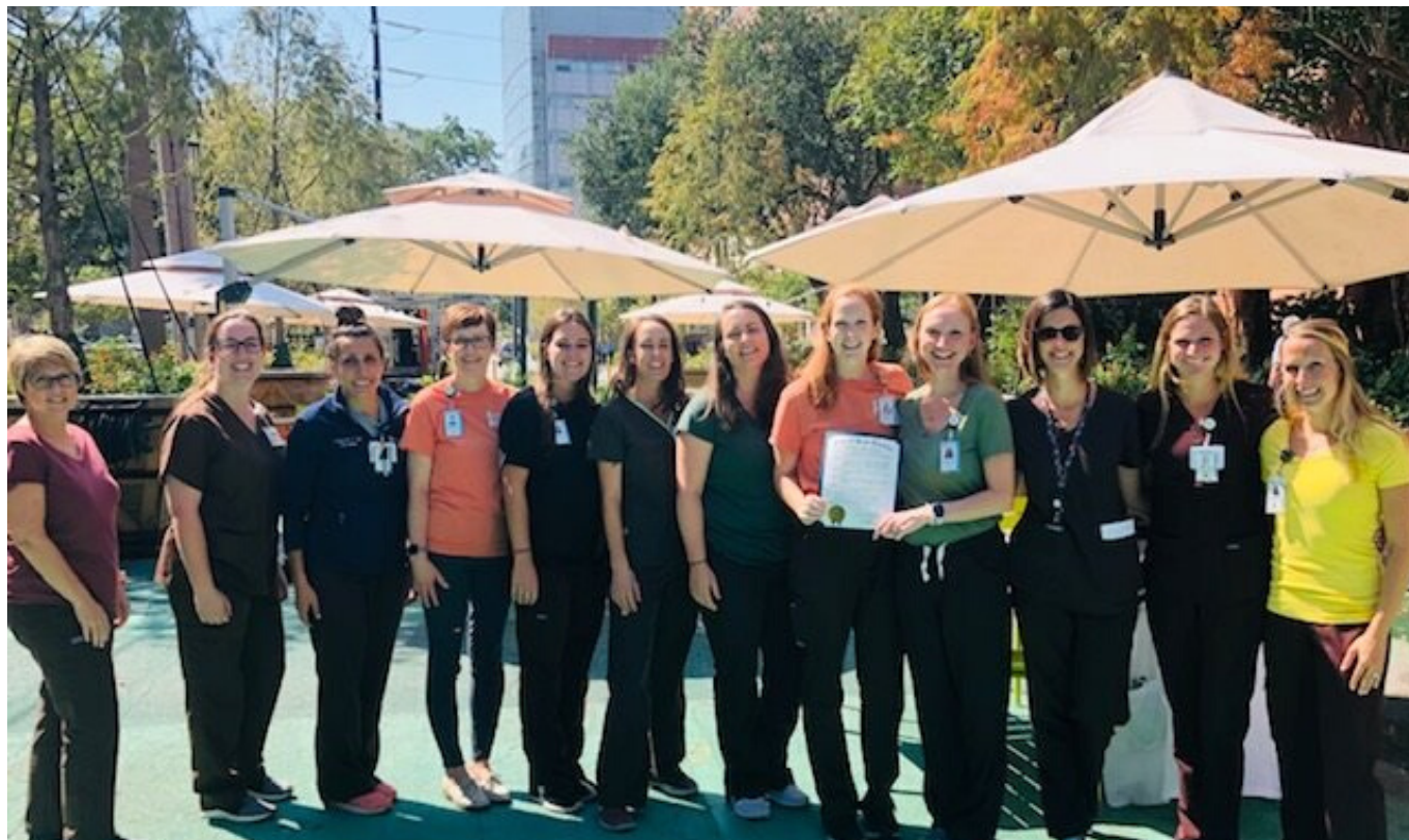
RDs gather on September 27, 2019 for a picture with the South Carolina Governor's Proclamation of Malnutrition Awareness Week.