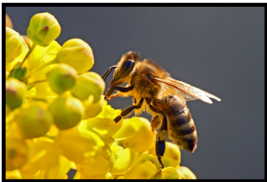
Fig. 2 Colletes inaequalis 1